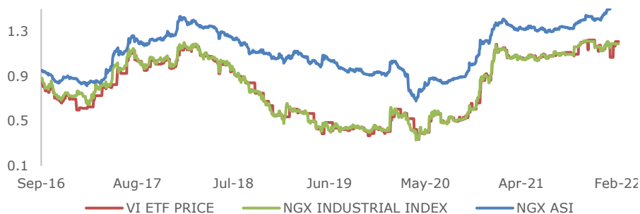
Price Movement vs NGX Industrial