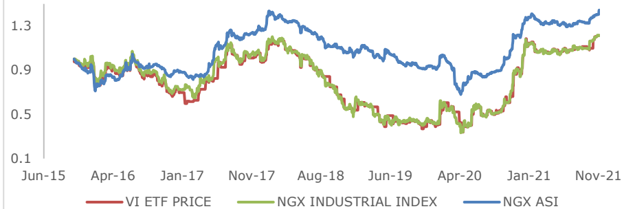
Price Movement vs NGX Industrial