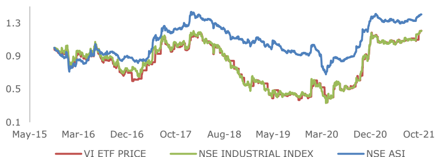
Price Movement vs NSE Industrial