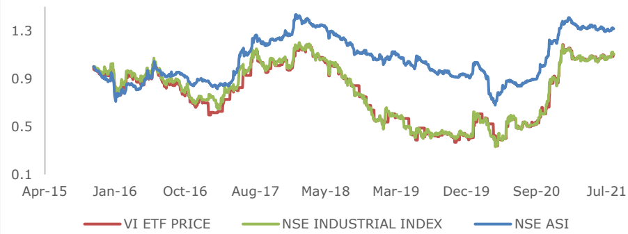
Price Movement vs NSE Industrial