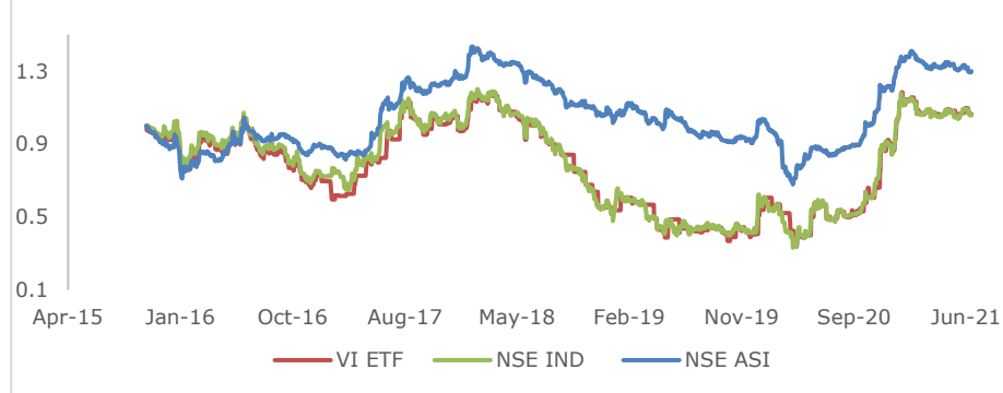
Price Movement vs NSE Industrial