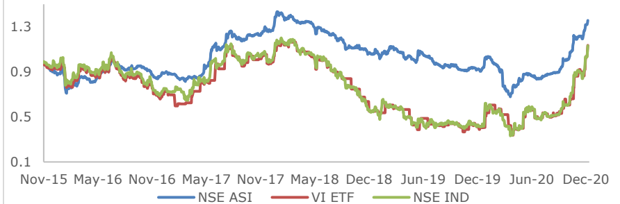
Price Movement vs NSE Industrial