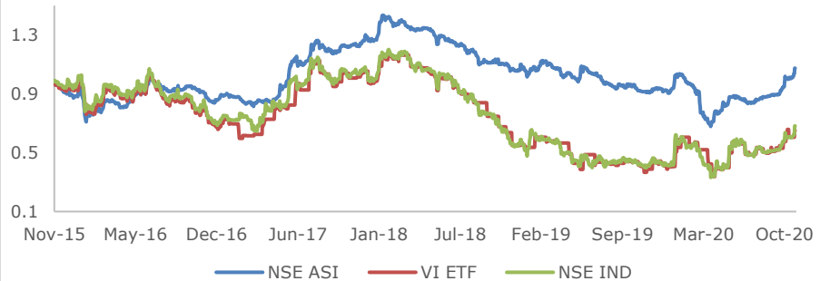
Price Movement vs NSE Industrial