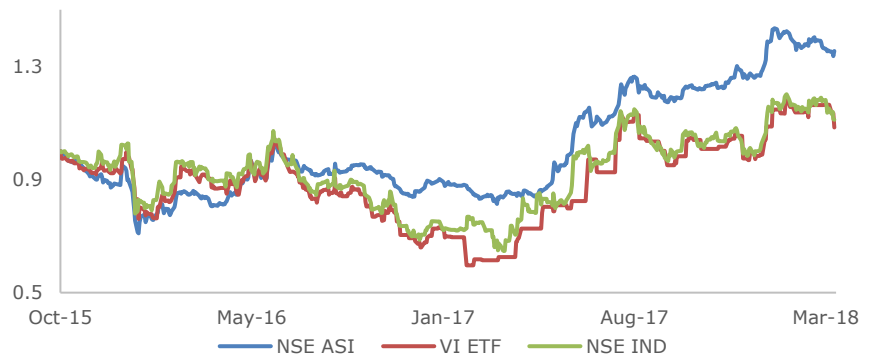
Price Movement vs NSE Industrial vs NSE ALSI