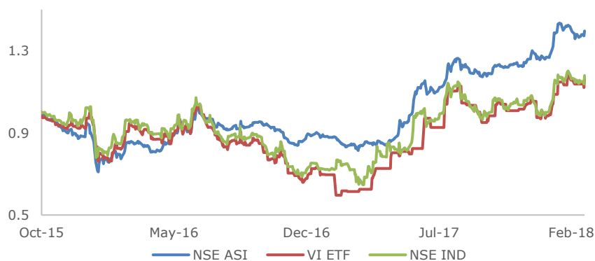
Price Movement vs NSE Industrial vs NSE ALSI