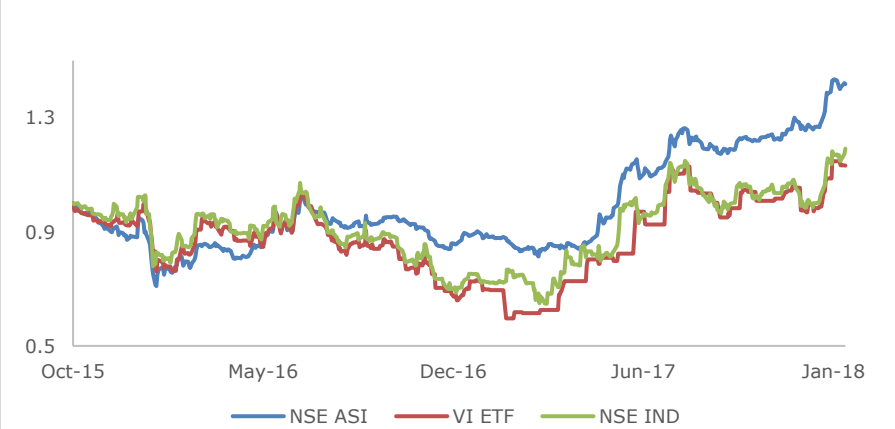
Price Movement vs NSE Industrial vs NSE ALSI