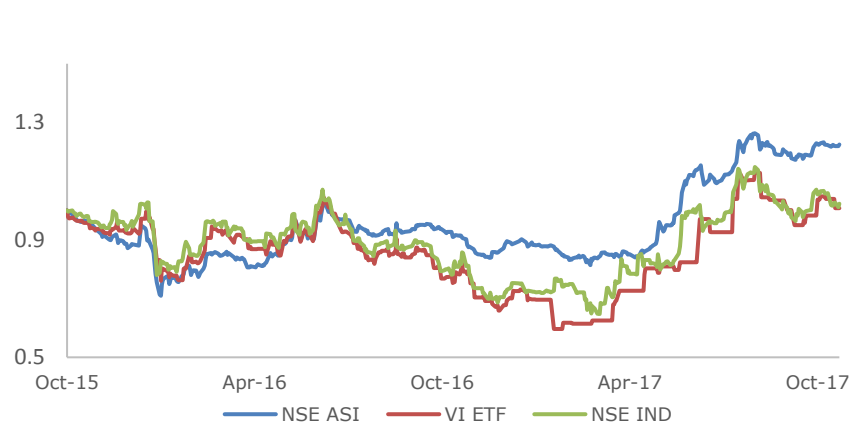
Price Movement vs NSE Industrial vs NSE ALSI