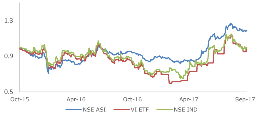
Price Movement vs NSE Industrial vs NSE ALSI