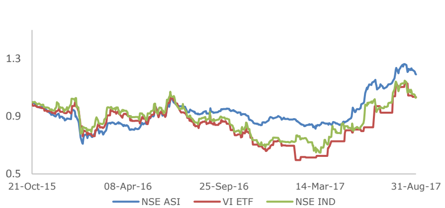
Price Movement vs NSE Industrial vs NSE ALSI