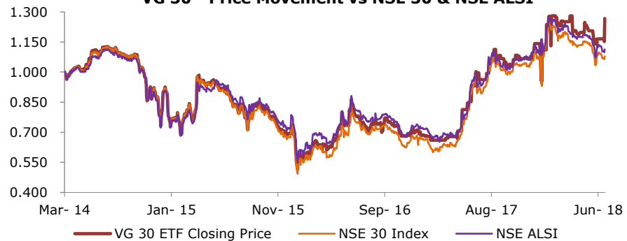
VG 30 - Price Movement vs NSE 30 & NSE ALSI

*Performance inclusive of distribution to unitholder within period