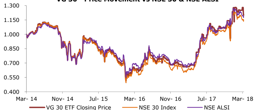
VG 30 - Price Movement vs NSE 30 & NSE ALSI