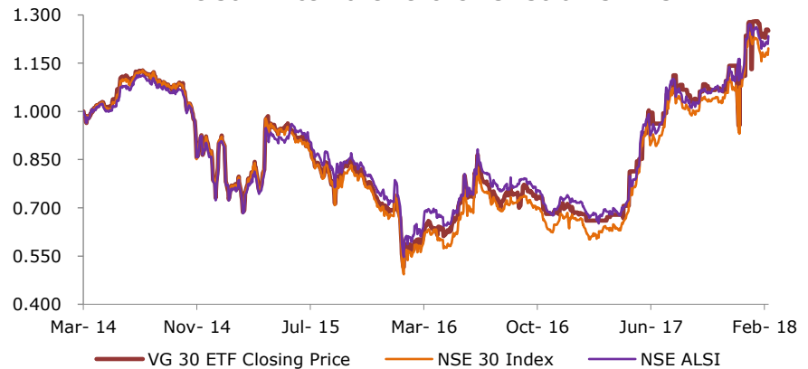
VG 30 - Price Movement vs NSE 30 & NSE ALSI