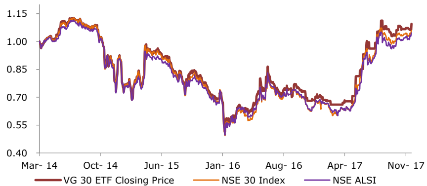
VG 30 - Price Movement vs NSE 30 & NSE ALSI