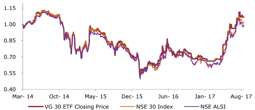
VG 30 - Price Movement vs NSE 30 & NSE ALSI