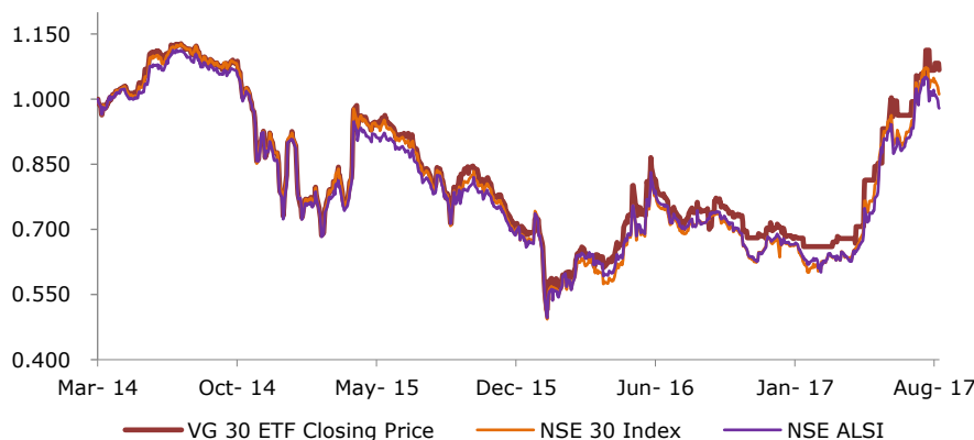
VG 30 - Price Movement vs NSE 30 & NSE ALSI