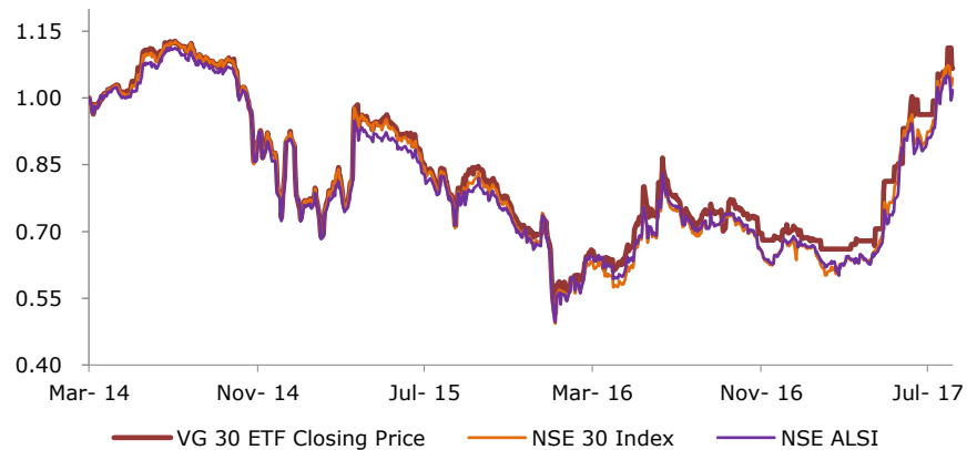
VG 30 - Price Movement vs NSE 30 & NSE ALSI