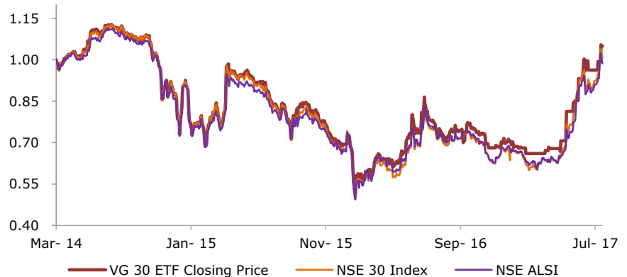
VG 30 - Price Movement vs NSE 30 & NSE ALSI