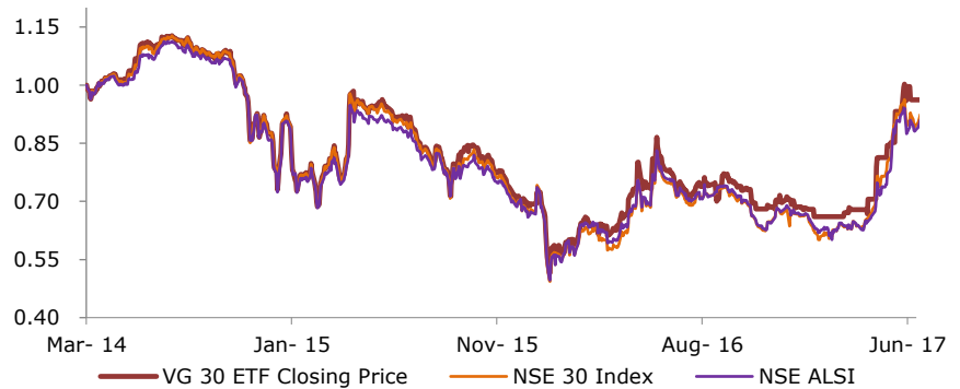
VG 30 - Price Movement vs NSE 30 & NSE ALSI