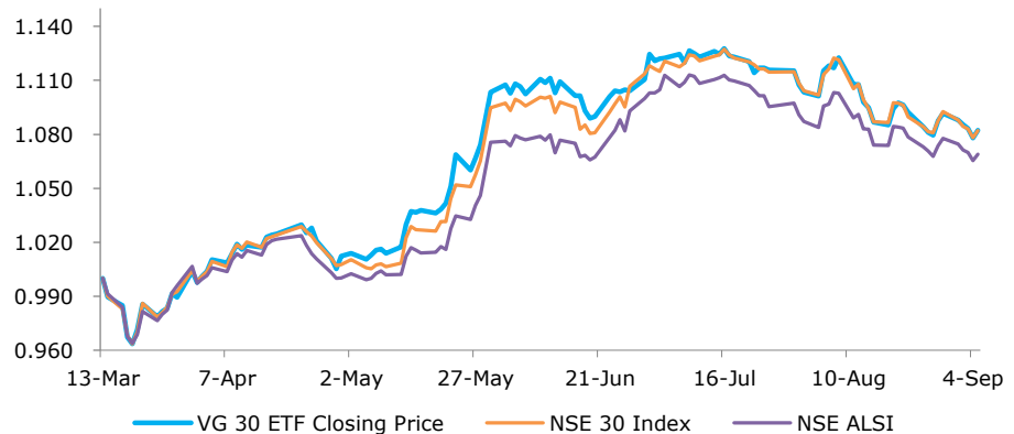
Price Movement vs NSE 30 & NSE ALSI