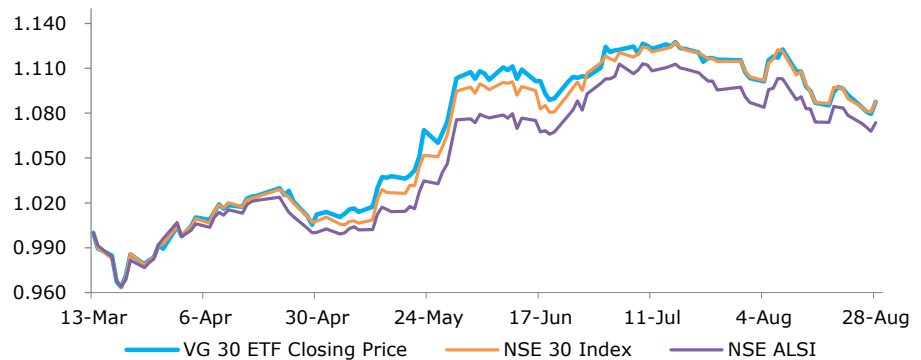
Price Movement vs NSE 30 & NSE ALSI