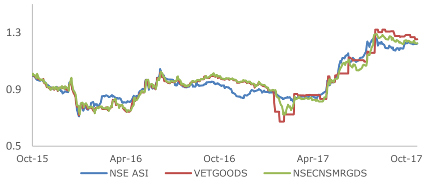
Price Movement vs NSE Consumer Goods vs NSE ALSI