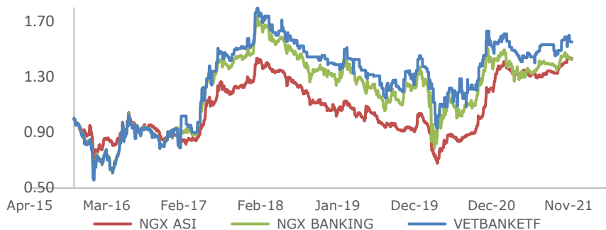
Price Movement vs NGX Banking