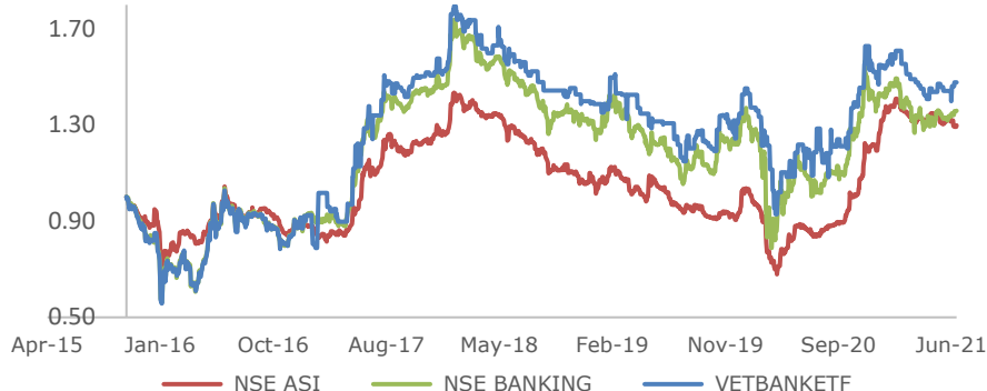
Price Movement vs NSE Banking