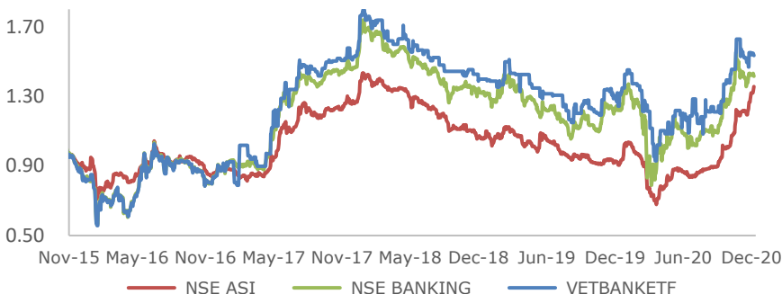
Price Movement vs NSE Banking