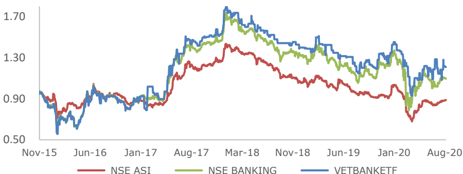
Price Movement vs NSE Banking