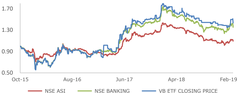
Price Movement vs NSE Banking