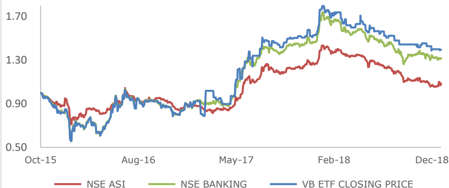
Price Movement vs NSE Banking