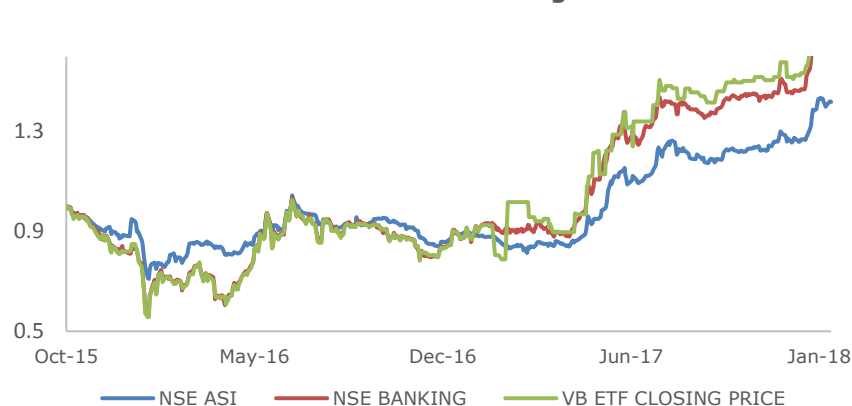
Price Movement vs NSE Banking vs NSE ALSI