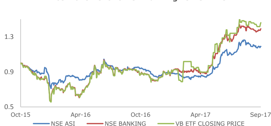
Price Movement vs NSE Banking vs NSE ALSI