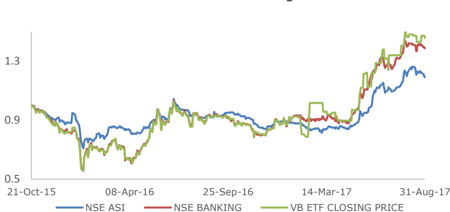
Price Movement vs NSE Banking vs NSE ALSI