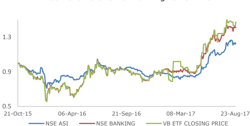
Price Movement vs NSE Banking vs NSE ALSI