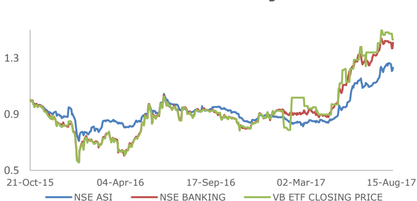
Price Movement vs NSE Banking vs NSE ALSI