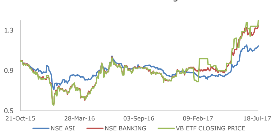
Price Movement vs NSE Banking vs NSE ALSI