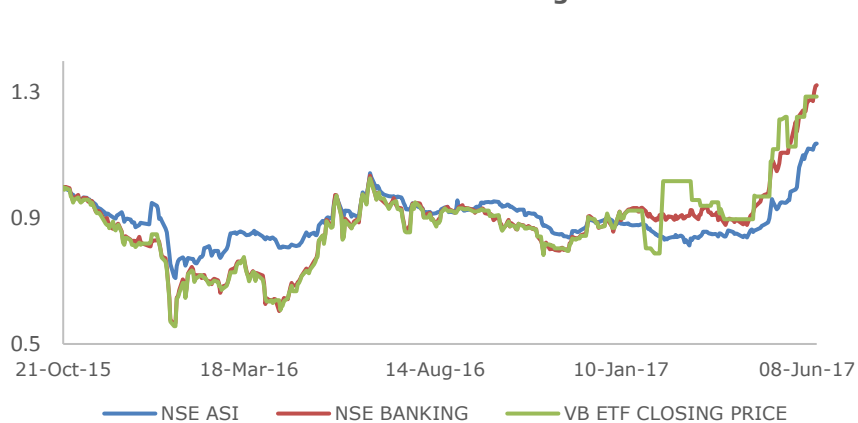
Price Movement vs NSE Banking vs NSE ALSI